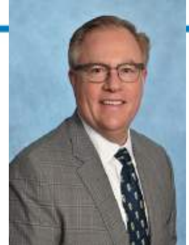
President of Neumann University